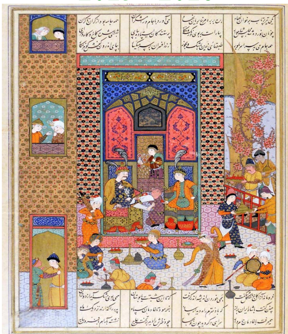
Shangul, Shah of Hind entertains Bahram Gur (Shah Nama)

Khuda Bakhsh Oriental Public Library, Patna